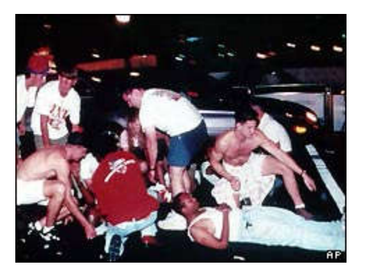
Fig. 2- The victims of the bombing in Atlanta in 1996

When a 20-kg bomb exploded at the Olympic Park in 1996 in Atlanta two persons were killed and 111 wounded (Fig. 2). These two lessons are very instructive, especially for the host countries of the Olympic Games. Underestimating such events in the coming period could further aggravate and complicate the security of the Olympic Games.