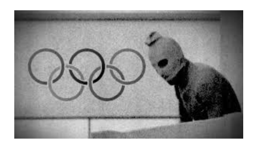
Fig.1 - Palestinian terrorists in Munich in 1972

The act of an organized terrorist attack on Israeli athletes in 1972 in Munich stunned the whole world, and since that day the Games have never been the same. Many countries have during crises like the Cold War boycotted the Olympic Games, while the police and even the army guarded athletes as if they were the most senior political representatives. That's what to a certain extent has managed to prevent any further terrorist attempts at prestigious sporting events.